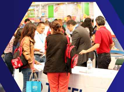
International MEXTESOL Convention Strengthening Learning Communities October 9-12, 2017 Poliforum León,